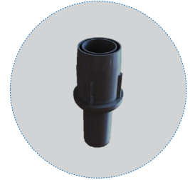
Adjustable Bullet Feet